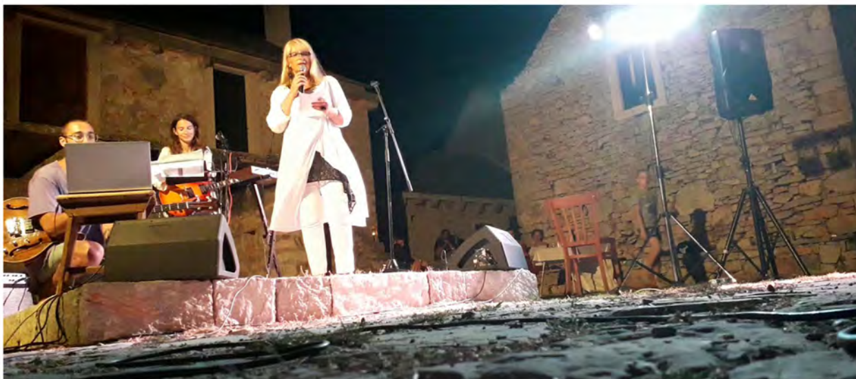
A few notes about our short lives (2018) traditional/soundscape/performance Where did you go? Nowhere! What did you do? Nothing! self- produced in collaboration with LAB 852 for the 4. Etno Hvar festival