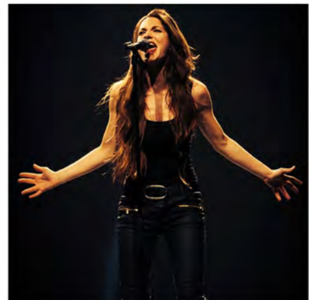
The little man wants to cross the line (2014.) theatre/concert/performance Music, theatre and art did not fulfill their promises about the changes in society. production: MONTAŽŠTROJ