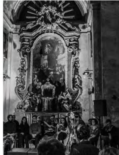
Where do you draw the line? (2017.) theatre/concert/radiophonic We are the only ones responsible for the lines we have (not) drawn. self - produced in collaboration with The Croatian National Radio and SKROZ collective