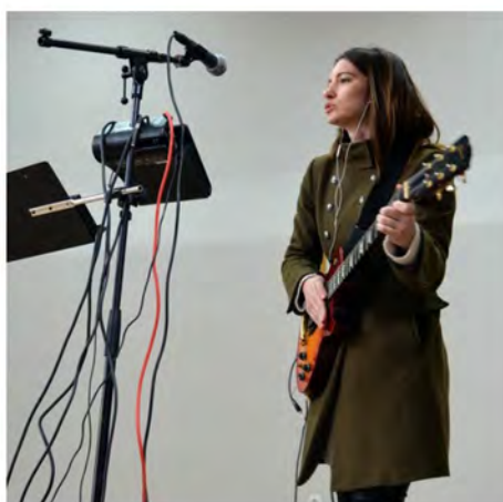
55th Goran's spring (2018) poetry/improvisation/performance

a series of instrumenatal and vocal improvisation with contemporary poets during Croatia's oldest and most acknowledged poetry festival in Rijeka, Zagreb, Lukovdol and Pazin