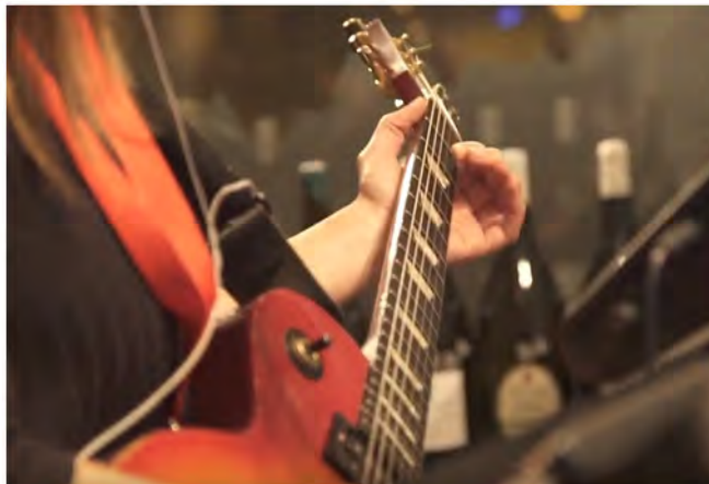
Winesthesia (2018) wine tasting/concert/performance

The synesthesia of senses: a whole new level of wine tasting.