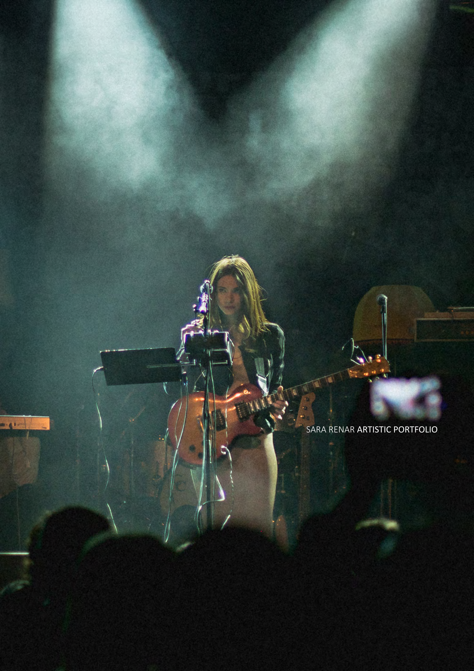
SARA RENAR ARTISTIC PORTFOLIO