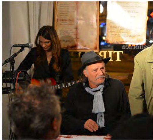
Remembering Tin (2015 - present) theatre/poetry/performance The traditional anual festival in honour of the great pet Tin Ujevic. production: Teatar Poezije