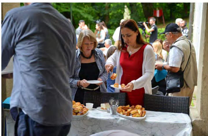
Breakfast with Krleža (2015. 2017) theatre/concert/performance The anual summer gathering in honour of the great writer Miroslav Krleža. production: Teatar Poezije