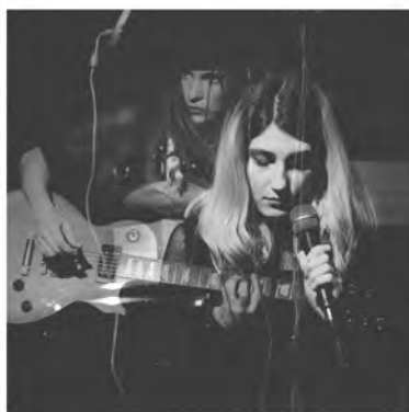
U PRIVREMENOM SMJEŠTAJU KOD LJUDI (Temporary accomodation with humans) Self-Released 2019.