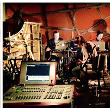
Tesla n' Twain (2016) theatre/radiodrama/performance

Exploring the conversation between Mark Twain and Nikola Tesla: the most extraordinary penpals.