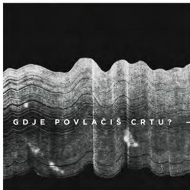
GDJE POVLAČIŠ CRTU? (where do you draw the line?) Tondak 2018.