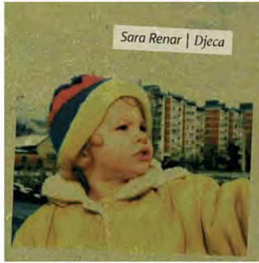
DJECA (Children) Aquarius Records 2013.