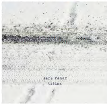
TIŠINA (Silence) Aquarius Records 2016.