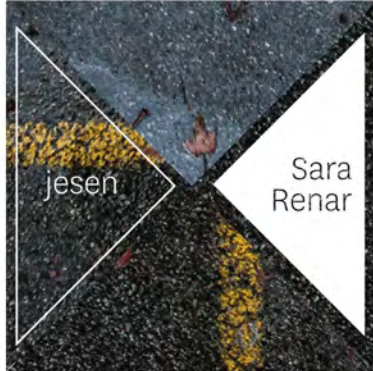
JESEN (Autumn) Aquarius Records 2014.