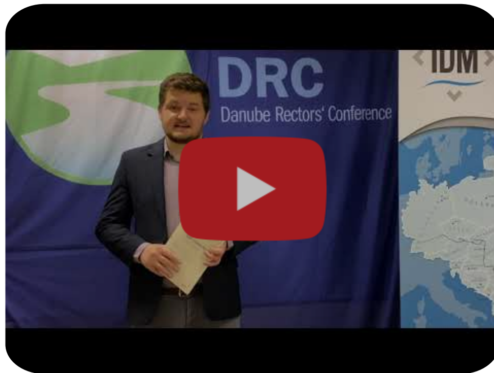
DRC's initiatives empowering young people in the Danube Region