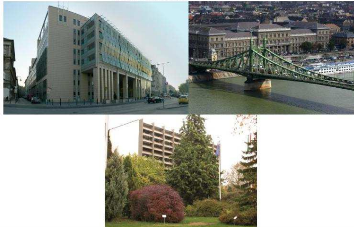
Közgáz Campus / Buda Campus