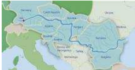
JRC Annual Event on the Scientific Support to the Danube Strategy